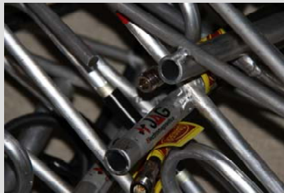
Sealed feed and welded elements