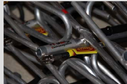
Type N female connector

*Site-specific mounting masts and clamps are recommended for this antenna. Please consult JAG to determine suitable accessories for your application.