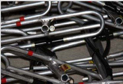
Folded dipole driven element